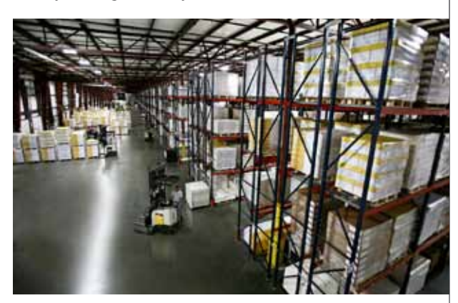
WOW's ever-changing warehouses with solid steel racks is filled with millions of pounds of cheese and paper created untenable RF issues.

WOW material handlers, forklift drivers, and truck loaders depend on Wi-Fi to make their warehouse processes more efficient by gaining universal access to real-time inventory information and eliminating counting and picking errors. The devices are used for a variety of purposes such as scanning palette and product locations, clocking hours, tracking product movements, tow motor inspection, trailer inspections, driver signatures, calendar entries, and MSDS tracking.